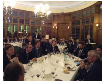
Lunch at the "Library" hall