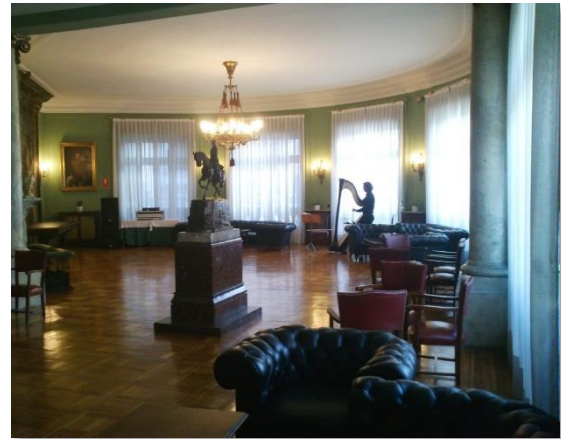
Salón Primo de Rivera